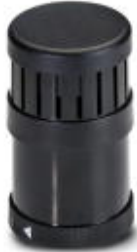
Siren element, pulse tone, 24 V DC, self-regulating volume, max. 100 dB(A), black

Please be informed that the data shown in this PDF Document is generated from our Online Catalog. Please find the complete data in the user's documentation. Our General Terms of Use for Downloads are valid ( http://phoenixcontact.com/download )